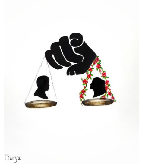
The Art of Darya Parsia